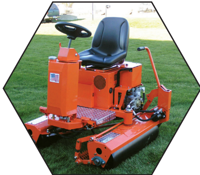
GAS GREENS ROLLER MODEL HP11

Salsco has the best warranty in the industry. 5 years!