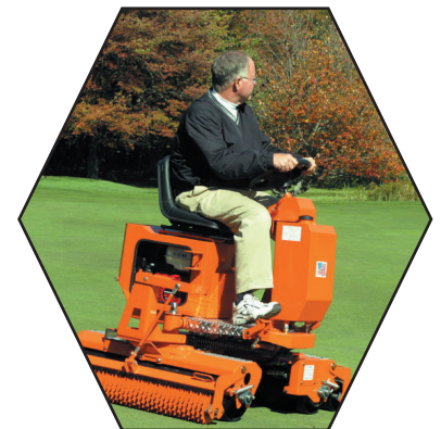
GAS GREENS ROLLER MODELS 09065 & 09067