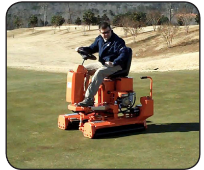
GAS GREENS ROLLER MODEL HP5.5

Oscillating roll design allows Salsco Greens Rollers to smooth the surface without changing undulations designed into the greens.