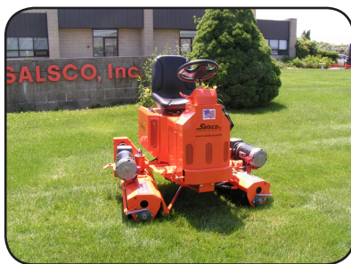
ELECTRIC GREENS ROLLER, QC MODEL 09074

Best engine selection. The engines are sized to the demands for the product, no wasted HP. This limits our green foot print.